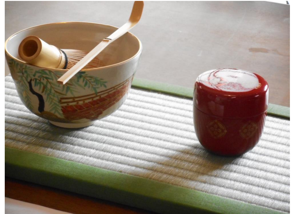
table tea party (BONTEMAE)