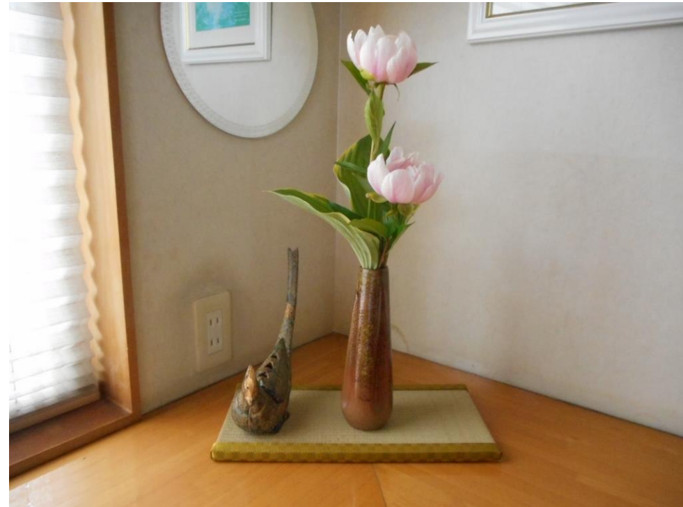
Suitable for Japanese-style ornaments (incense burners, etc.)