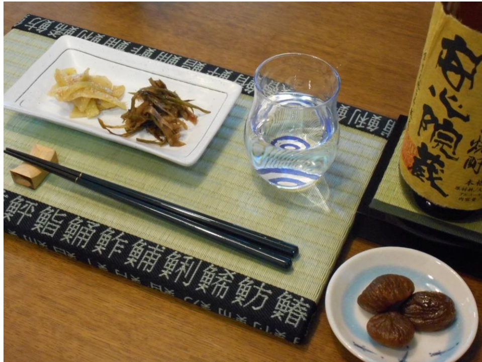
With a cup of SAKE (remote drinking party)