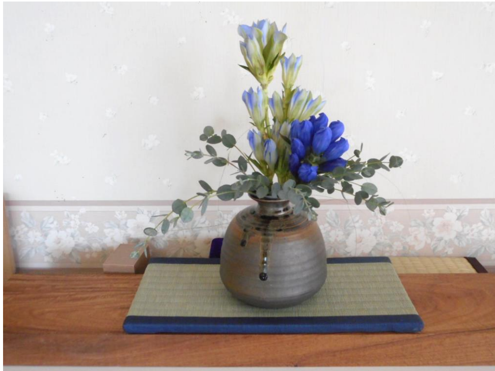
With pottery (ceramics)